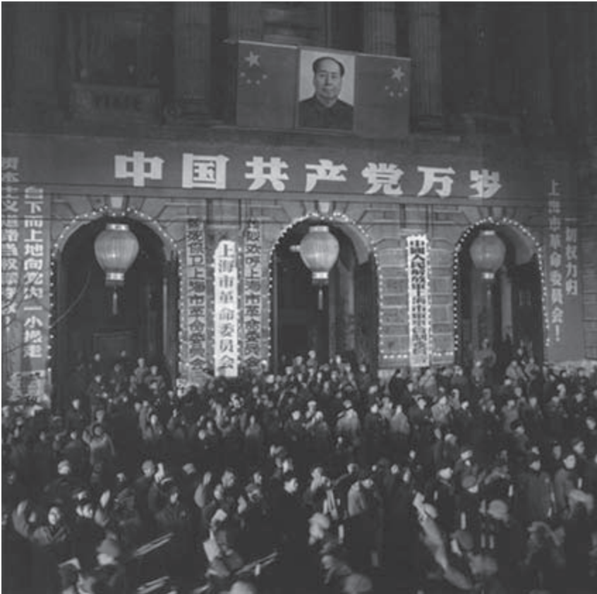
Figure 4. Shanghai's January Revolution. From China Pictorial , no. 11 (1967).

Revolutionary Committee of Shanghai. The exalted principles of the Paris Commune evaporated into the void (see Figure 4).